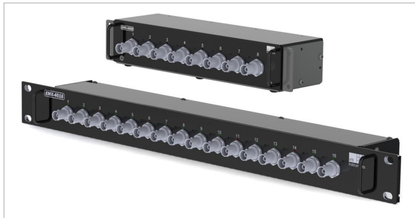
EMX-4008 & EMX-4016 - 8 & 16 CHANNEL BREAKOUT BOXES

To increase ease of distribution, VTI also incorporated custom breakout boxes (BOBs) to the final solution. The previous legacy test system being used incorporated BOBs that were rack mounted. The new BOBs could be pulled out from the rack mount and distributed around the test bed.