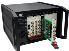
9-Slot 3U PXIe High Performance Rugged Chassis, up to 8 GB/s Bandwidth

The system was quite large and since the control room is located at a substantial distance from the test article, it was constructed using large runs of sensor cabling which complicated maintenance and part replacement.