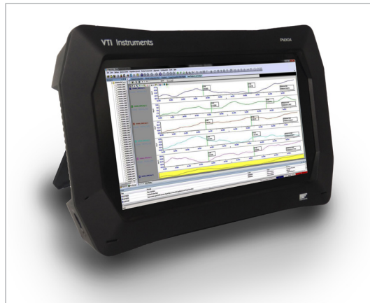
PMX04 PORTABLE 4-SLOT PXIE 'TABLET'

The PMX04 Portable 4-Slot PXIe 'Tablet' installed with EMX-4250's further improved ease of use and portability, as it provided the test engineers with a mobile test system that they could carry to any point near the aircraft and quickly set up and acquire data on the spot.