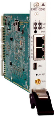
Gigabit Ethernet LXI Controller

The rugged design of the CMX09 PXI Express chassis meant that the units could be easily distributed in an industrial environment with a minimized risk of unit damage. By placing the instrumentation closer to the aircraft, the manufacturer was able to reduce the length of sensor cabling, reducing overall cost while improving signal integrity. The smart cooling of the system pulls air in from the sides and circulates throughout the chassis to maintain ideal temperature, allowing for tests to be conducted for long periods of time without overheating, eliminating the need for costly retests and ensuring accurate data. The chassis also offers health monitoring in the front of the mainframe, giving alerts when issues arise and allowing automatic shutdown in case of an error. With a loaded weight of 15 lbs., the CMX09 is also considerably lighter than the legacy mainframes that were in use, allowing for easy transport around the unit under test (UUT).