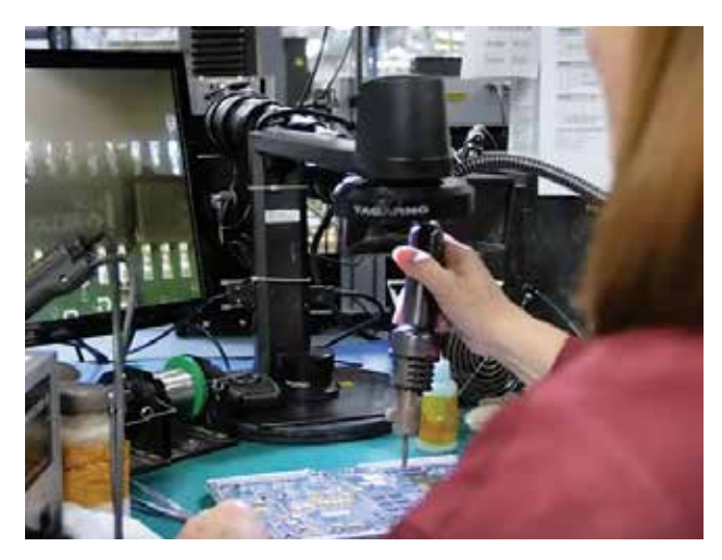
With development and manufacturing facilities in Huntsville, AL and Towcester, UK and offices throughout the USA, Europe and Asia, we serve customers worldwide.