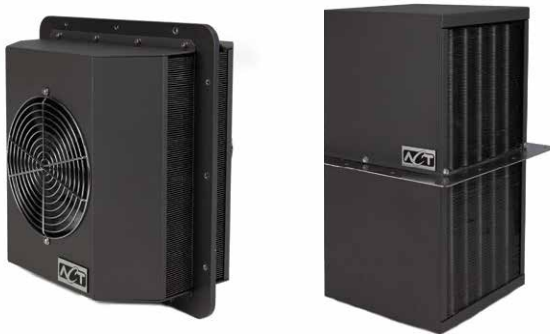
Figure 2: Heat Sink Cooler Heat Exchanger (left) and Heat Pipe Cooler Heat Exchanger (right)

Both of these types, as well as other true heat exchangers are called “above ambient” solutions. Meaning the inside cabinet temperature must be hotter than the ambient air in order to work. Many ask, “why do I need a heat exchanger if my cabinet is hotter than the outside air, why can’t I just transfer heat from the cabinet walls?” Heat will be transferred through the walls but the amount of heat that can be transferred is dependent upon the surface area, which can be a limiting factor. An air-to-air heat exchanger adds a lot of available surface for heat transfer in a very compact assembly. The following example demonstrates this.