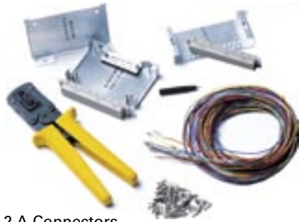
2 A Connectors