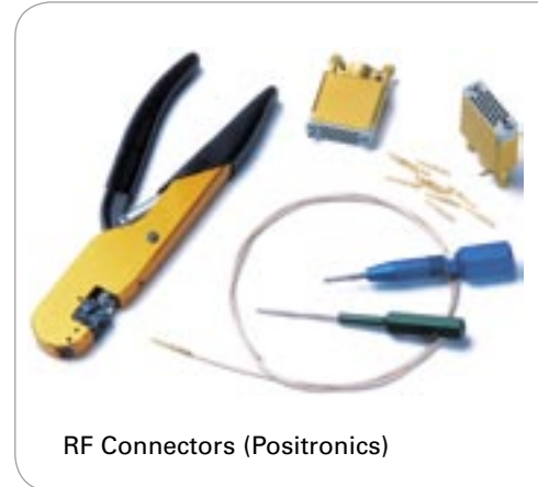
RF Connectors (Positronics)