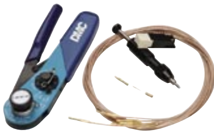
RF Quick Disconnect