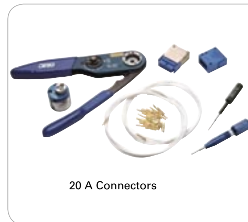
20 A Connectors