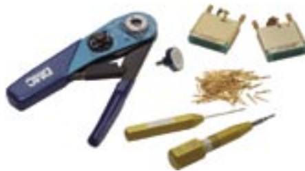
5 A Connectors