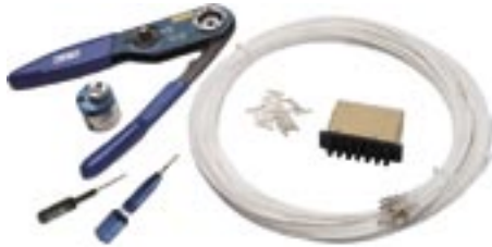
30 A Connectors