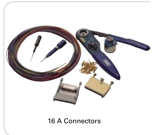
16 A Connectors