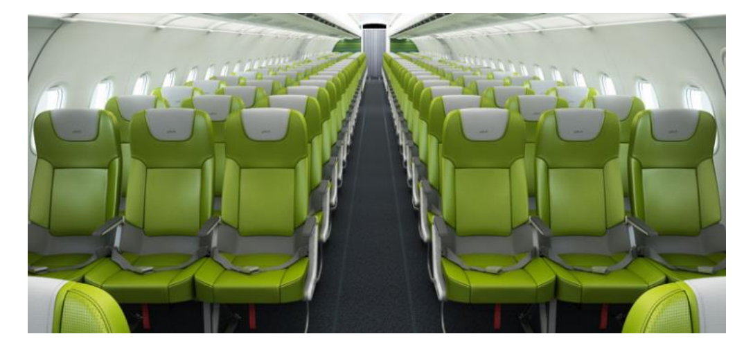
Imagine if airlines only allowed one person per row ...