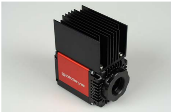
Figure 1: Goldeye standard model with a single heat sink set applied to the top.

Goldeye standard camera models may not be able to dissipate sufficient heat without a good thermal connection. This may result in a decreased performance of the sensor cooling.