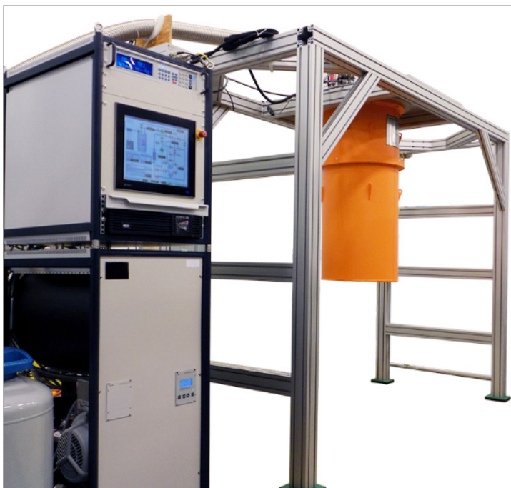
JDry-250 Cryogen-Free Dilution Refrigerator Under Test

The JDry-250 model is fitted with a cold-plate of 305 mm (12") diameter, and provides a cooling power of more than 250 \mu W at 100 mK.