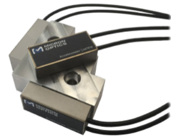
os7500 accelerometer on a 3 axis mounting block