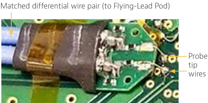
Flying-Lead Probe Attachment

Working together with the Analyzer, the Flying-Lead probe is used to debug and verify new hardware ICs, new system hardware implementations, firmware, validation of system BIOS and software, and supports manufacturing test.