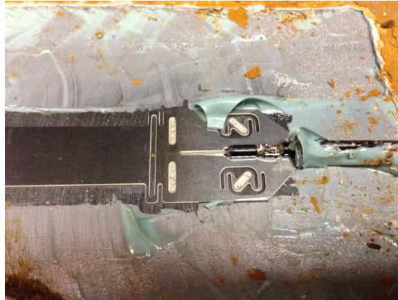
Figure 5 –Sensor Close-up

Figure 5 shows a close-up of the sensor and the degree of protection from corrosion.