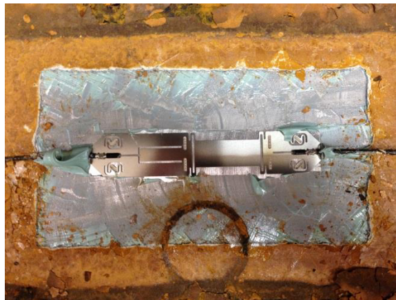
Figure 4 – Exposed Sensor

Figure 4 shows the sensor after removal of the STOPAQ. Starting from the corners of the STOPAQ, force the scraper under the STOPAQ working toward the center. The STOPAQ should pull cleanly off of the sensor due to the layer of polyimide tape covering the sensor.