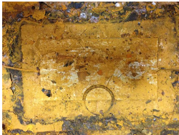
Figure 2 – Plate after saltwater exposure

Figure 2 shows the sensor plate after extended exposure to saltwater.