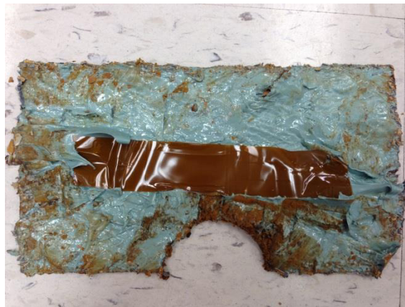
Figure 6 – Removed STOPAQ

Figure 6 shows the backside of the patch of STOPAQ Wrappingband removed from the plate. The rust flakes on the patch are from working the tool under the patch. Notice the strip of polyimide tape embedded in the STOPAQ.