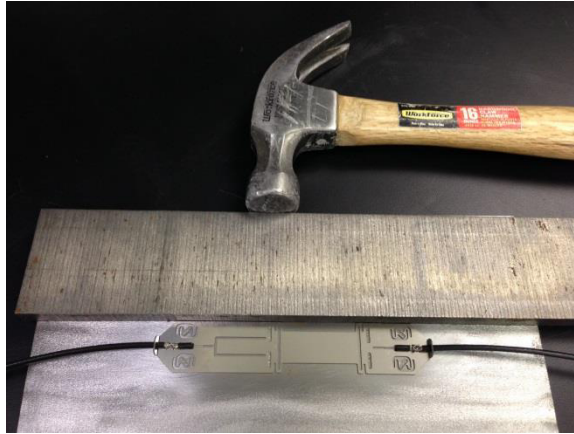
Figure 7 – Sensor Removal

The os3150 / os3155 sensor may be removed from the steel by sheering it off. Place a steel plate next to the sensor and strike sharply with a hammer as shown in figure 7.