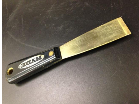
Figure 3 – Scraper/Putty Knife

Figure 4 shows the sensor after removal of the STOPAQ. Starting from the corners of the STOPAQ, force the scraper under the STOPAQ working toward the center. The STOPAQ should pull cleanly off of the sensor due to the layer of polyimide tape covering the sensor.