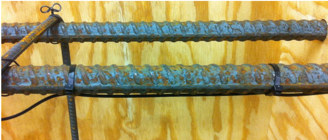
Figure 3 – Cable Protection

Route cable along rebar and hold in place with cable ties. Where possible, run the cable under the rebar and reinforcing members to better protect from the poured concrete and aggregate. Allow slack in the cable along the run so that the cable will not be placed in tension as the reinforcement moves around during the pour.