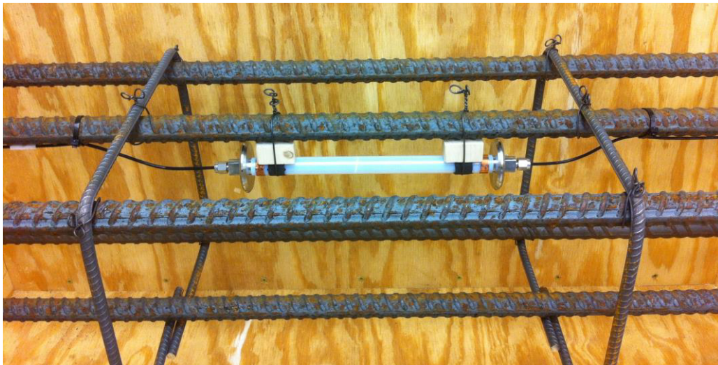
Figure 1 – Position Sensor

The os3600 with flanged ends is designed to be embedded into concrete or reinforced concrete. The flanges at either end of the sensor lock into the concrete and allow the sensor to measure the relative motion between the flanges and measure the concrete deformation along the sensor axis. The sensor is preset near the midpoint of its strain range. Prior to embedment, the sensor will expand and contract with temperature away from the midpoint. In extreme temperature environments, take precautions to moderate the sensor temperature while pouring.