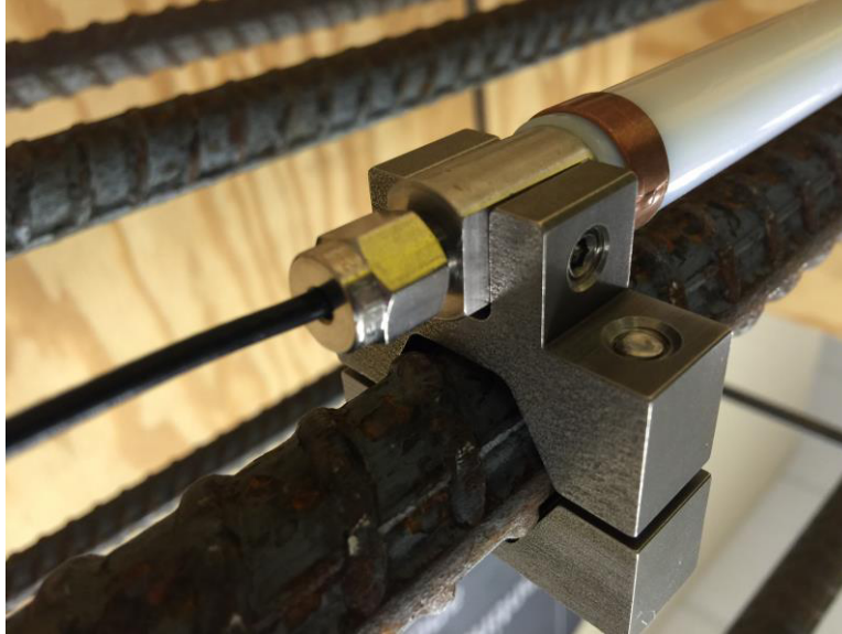
Figure 4 – Custom Mount

It is important that mounting brackets are properly spaced and axially aligned prior to attaching to rebar. If axial alignment is not maintained, the sensor may bind leading to reduced sensor accuracy. The installation jig shown in Figure 5 is available to hold the mounting brackets in alignment and properly spaced during attachment to the rebar. The installation jig has flats cut into each end that properly position the end brackets.