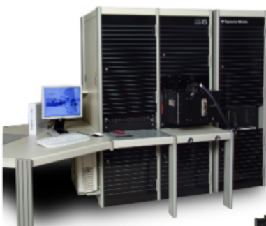
ATEC® Series 6

The RF instrumentation package includes PXI format synthetic instrument modules and the VIAVI NextGen bench test equipment.