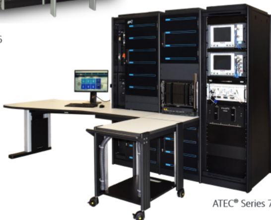
ATEC® Series 7