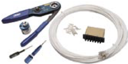
30 A Connectors