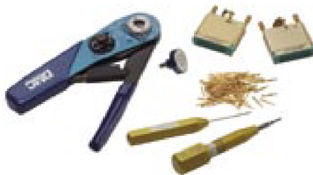
5 A Connectors