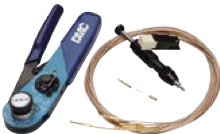
RF Quick Disconnect