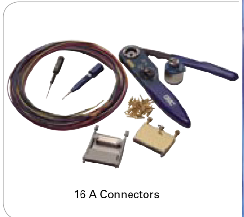
16 A Connectors