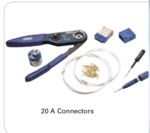
20 A Connectors