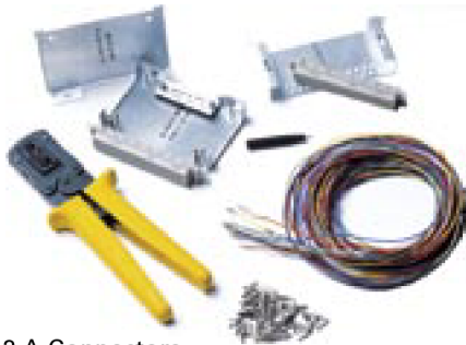
2 A Connectors