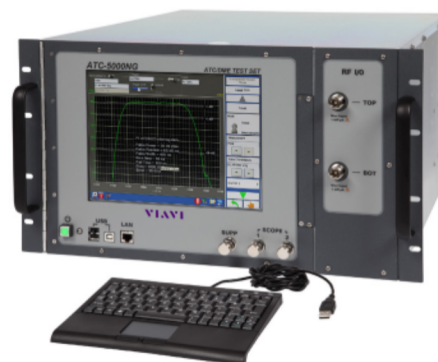
Standard accessories include keyboard with touchpad.